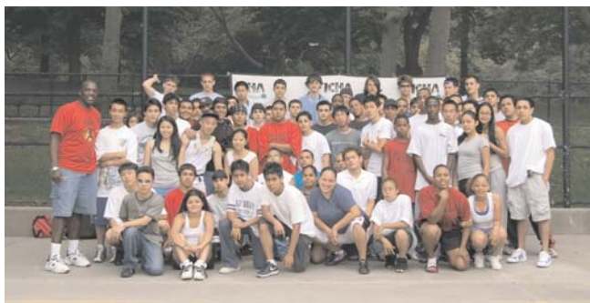
Just a few of the teen athletes that benefit from your donations