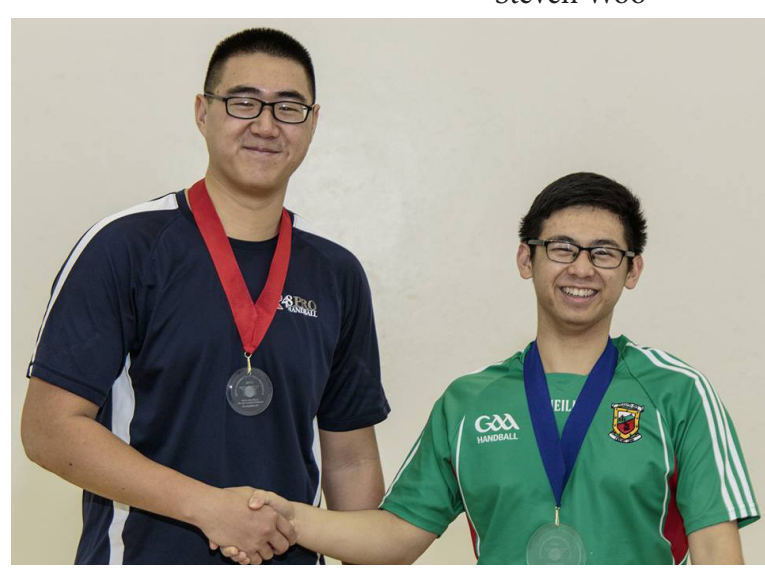
2016 44th Albany Opens 2nd Place Men's B Doubles

2016 44th Albany Opens 1st Place Men's B Singles