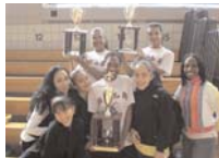
Proud Girl finalists of the PSAL Invitational