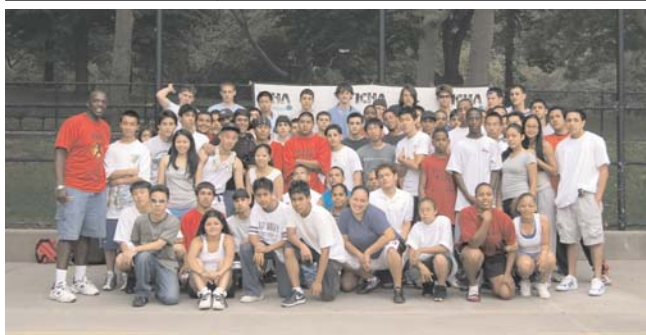
Just a few of the teen athletes that benefit from your donations