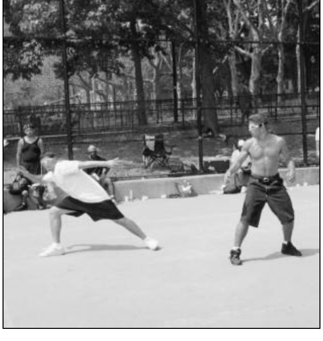
2002 Jr. Big Blue action in Lincoln Terrace Park Brooklyn, NY